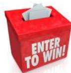
Christmas Colour Raffle